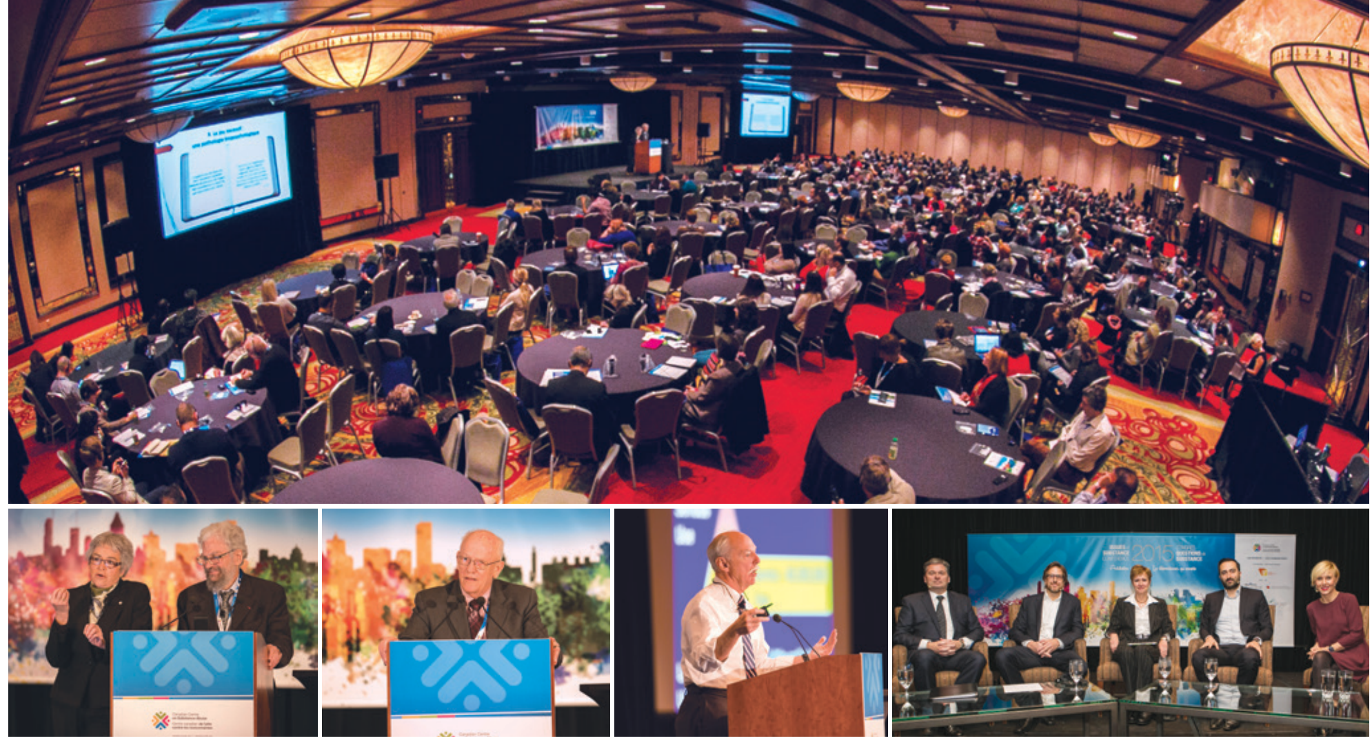
Issues of Substance Conference 2015