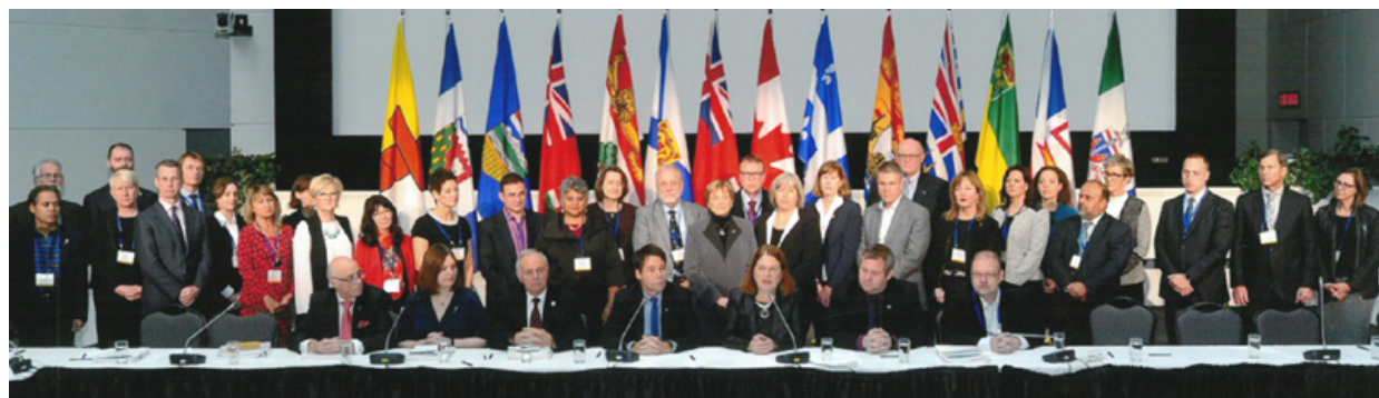
Figure 2. Participants at the opioid conference and summit on November 2016

The Opioid Summit, held the following day, brought together a smaller group of representatives of approximately 40 health professional associations, national organizations, pan-Canadian health organizations, regulators, decision makers and provincial/territorial ministries of health with the authority to commit to taking specific concrete actions to address problematic opioid use across Canada. One key accomplishment of this summit was having participants endorse the Joint Statement of Action, which reflects the commitment of partners to act on the crisis. All summit participants (see Figure 2), including the federal Minister of Health and nine provincial and territorial ministers of health, contributed to formulating the Joint Statement of Action, which includes clear deliverables and timelines. Each participating organization agreed to work within their respective areas of responsibility to reduce the harms associated with opioids through timely, concrete actions that deliver clear results. Organizations that signed the Joint Statement of Action also committed to reporting on their progress in delivering those results.